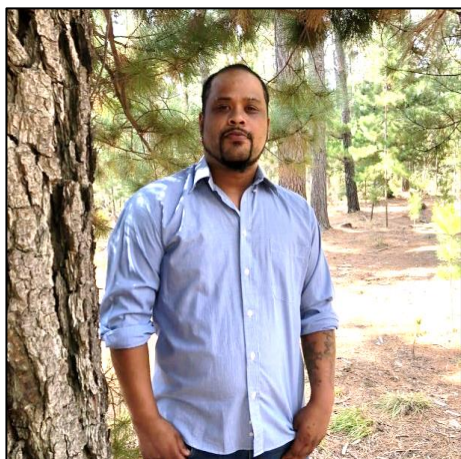
Drovigas Goshai Marlenique Packhouse, Simondium